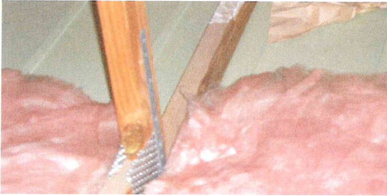
Single strap (clip) with at least 3 nails into the truss