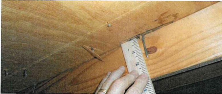
8d nails verified