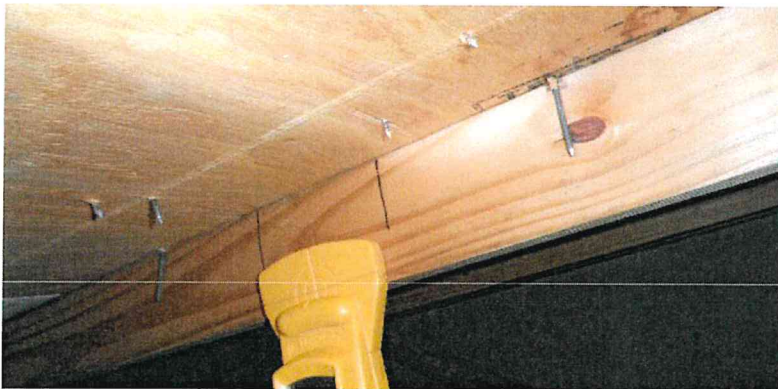
Nail location verified