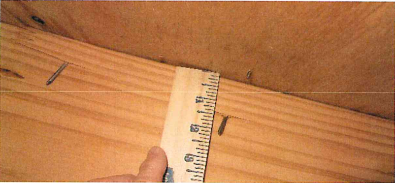
8d nails verified