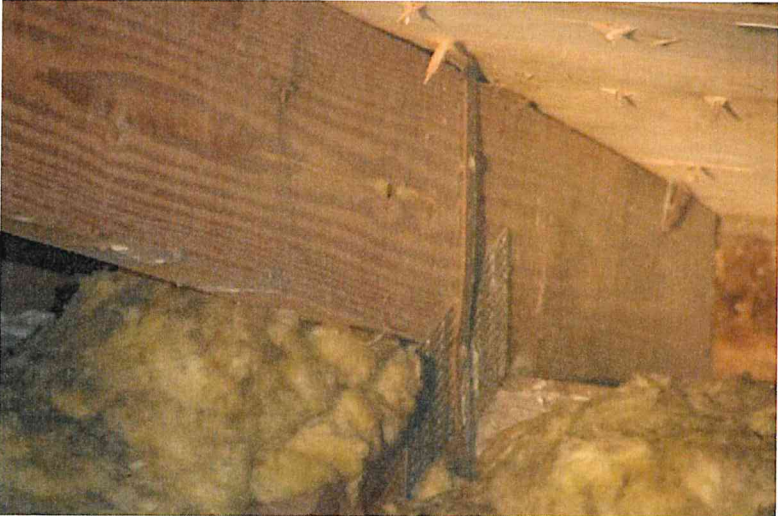
Single strap with 2 nails into the truss