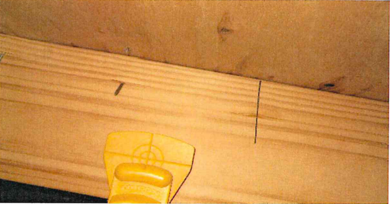
Nail location verified