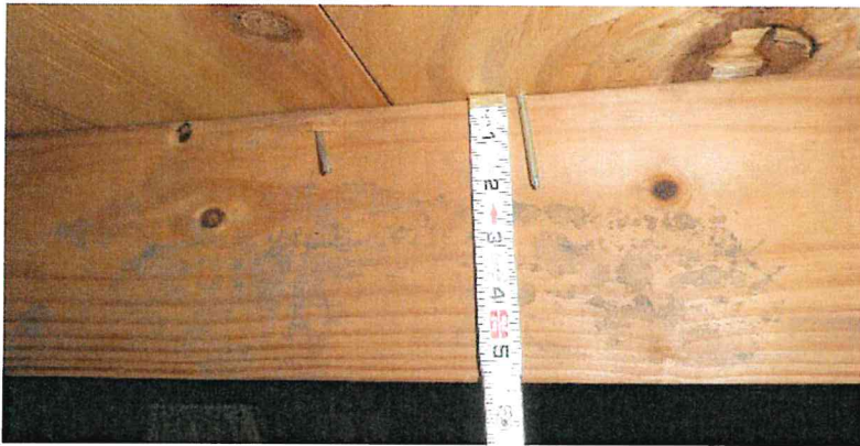
8d nails verified