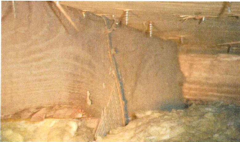
Single strap (clip) with at least 3 nails into the truss