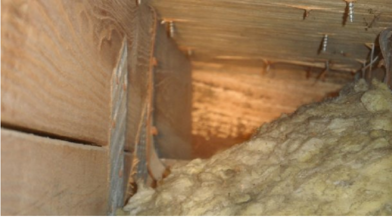
Single strap (clip) with at least 3 nails into the truss