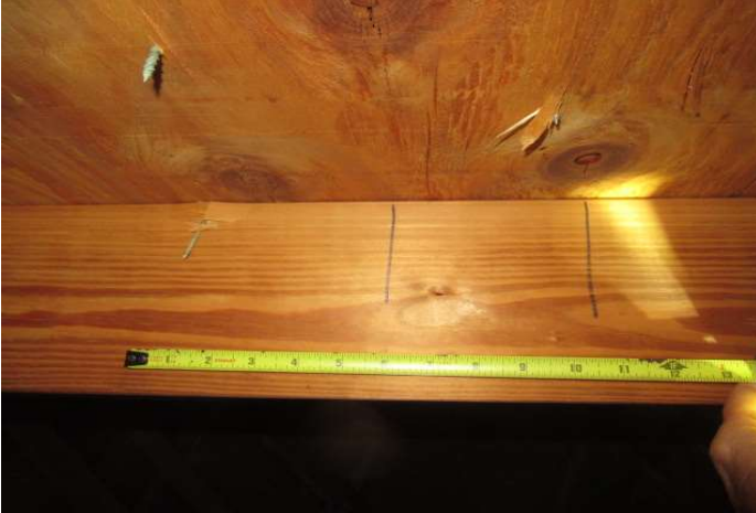
6" spacing in the field