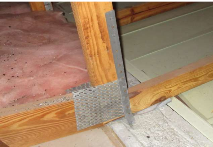
Single strap with at least 3 nails into the truss