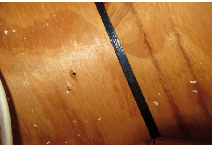
SWR installed under the tile